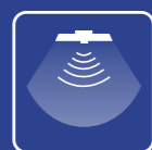
AVer Audio Fence